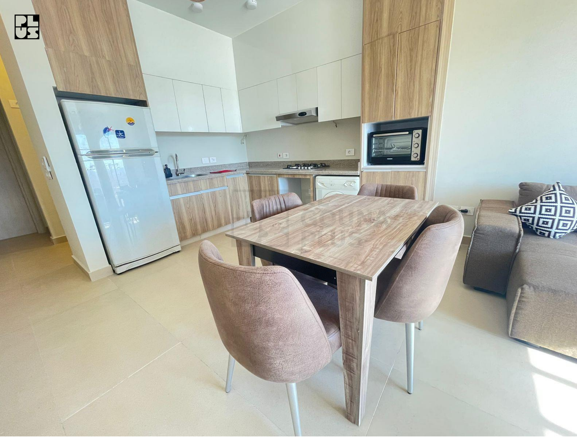
Kitchen / Dining