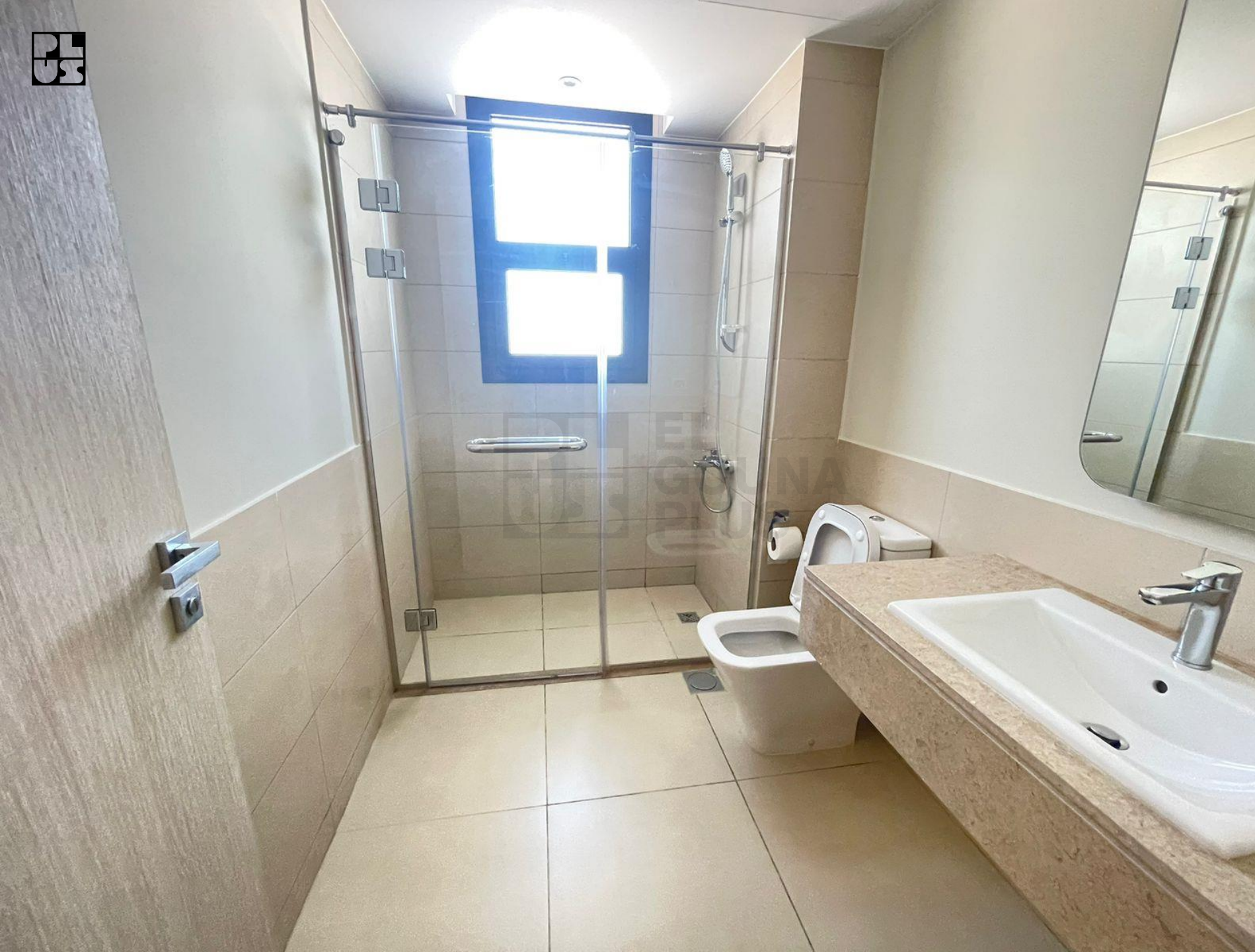
Full Bathroom 1