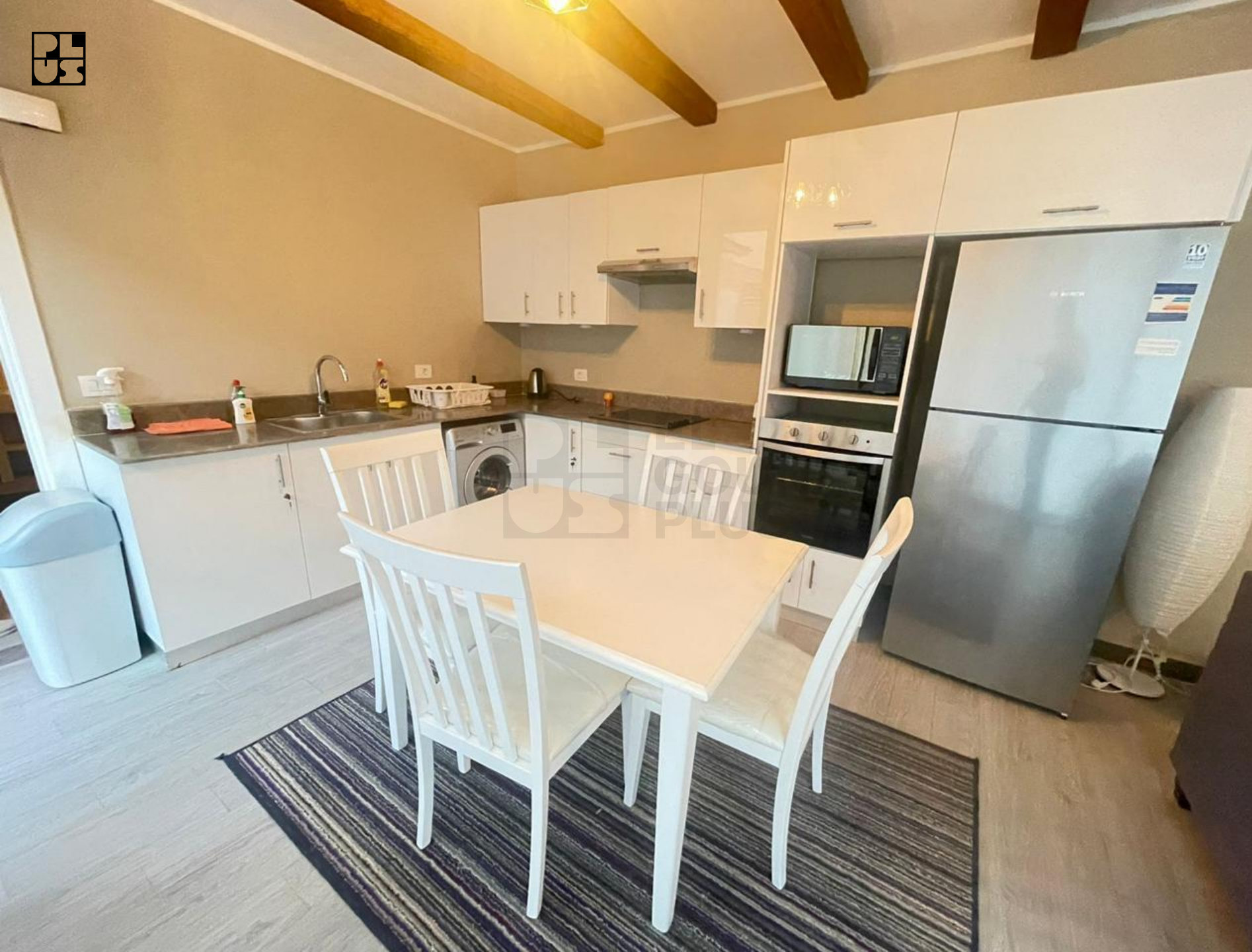
Dining Area / Kitchen